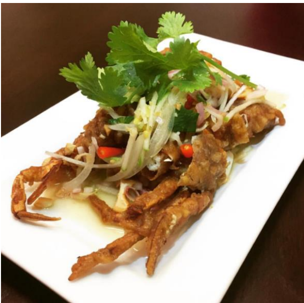
Soft Shell Crab Salad